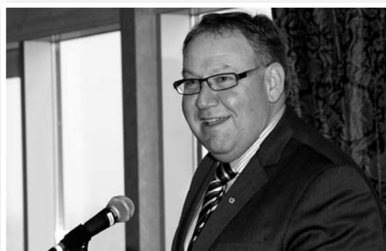
Special Guest Speaker The Honourable Darrell Dexter, QC, MLA, Premier of Nova Scotia